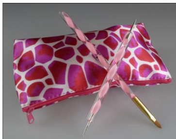
Artworks Possible with these Tools!